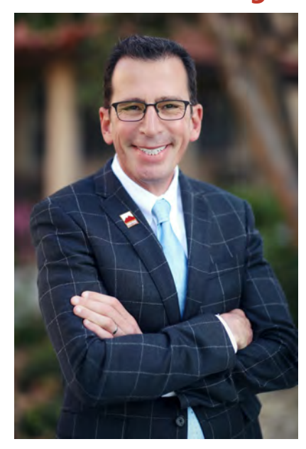
Welcome to Saddleback College!

Whether you are just starting out with us or are continuing your higher education journey, we are so happy you have chosen Saddleback. From your first visit to our campus (whether in-person or online), to the day you've accomplished your academic goals, our faculty, staff, and administration are dedicated to your success.