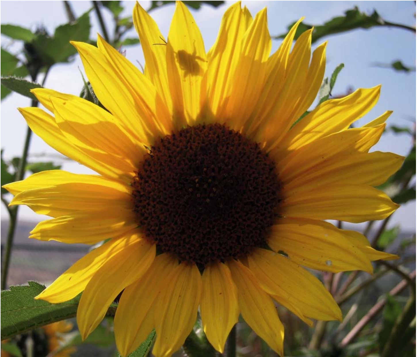
Sunflower, Helianthus , Photo by Jane Horlings, Horticultural area, Saddleback Campus